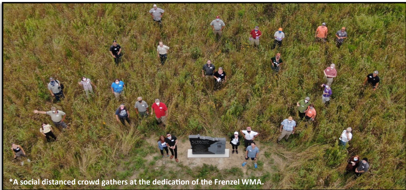
*A social distanced crowd gathers at the dedication of the Frenzel WMA.

The Dr. L Daniel Frenzel Jr. and Virginia Frenzel WMA, in Stearns County, is 240 acres comprised of rolling prairie hills and pot hole wetlands. This WMA was purchased in by Pheasants Forever in 2018 using Accelerating the WMA Program ML17 LSOHC funds. The property is home to many wildlife species and is open to public hunting and other outdoor recreation.